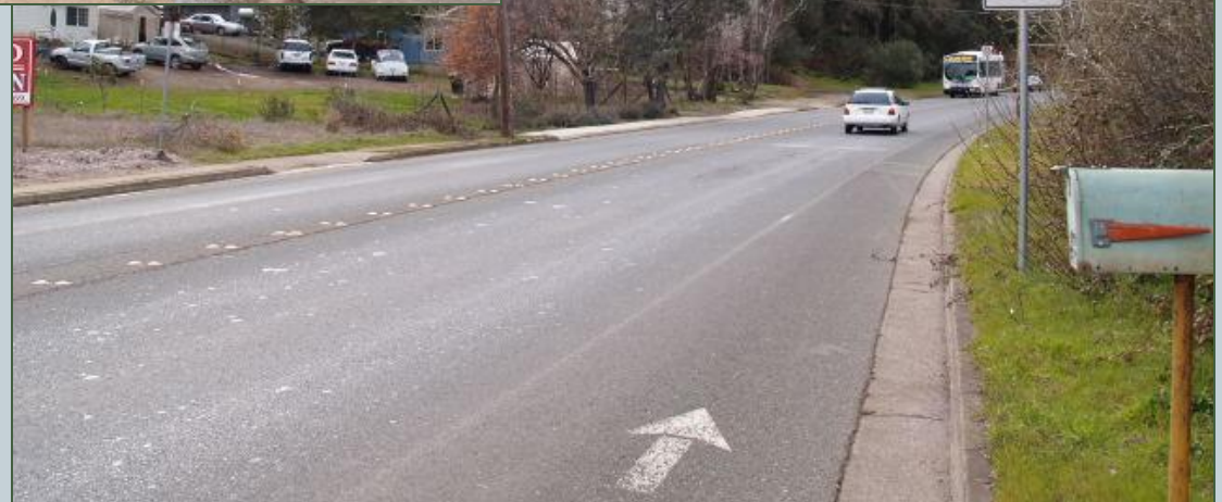
Views to the West on 11 th St.